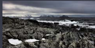
“ALNES SHORE” NOK 8.900,- (130x70cm)