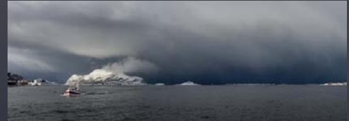
“BACK FROM THE FIELD” NOK 28.000,- (300x100cm)