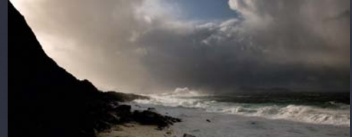
“REALITY” NOK 14.700,- (200x70cm)