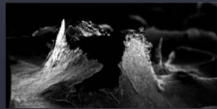
“BROKEN” NOK 21.000,- (200x100cm)