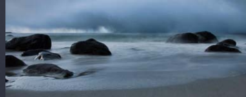
“STORM AT MULEVIKA” NOK 13.500,- (175x70cm)