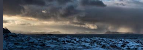
“FADING” NOK 31.500,- (300x100cm)