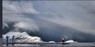
“MOLJA WINTER” NOK 18.500,- (200x100cm)