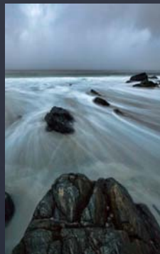
“TIDE” NOK 14.100,- (90x150cm)