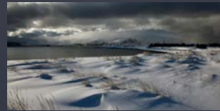
“SHADOWS” NOK 9.500,- (130x70cm)